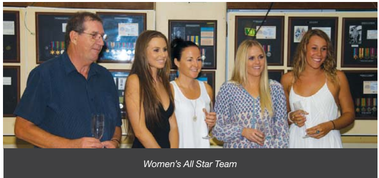
Women's All Star Team