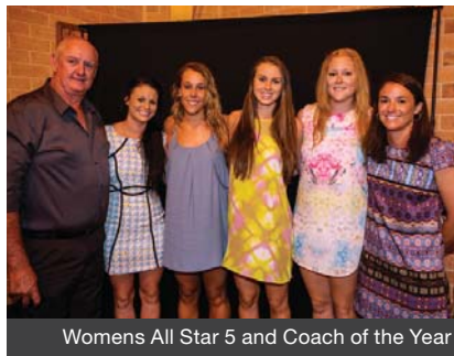
Womens All Star 5 and Coach of the Year