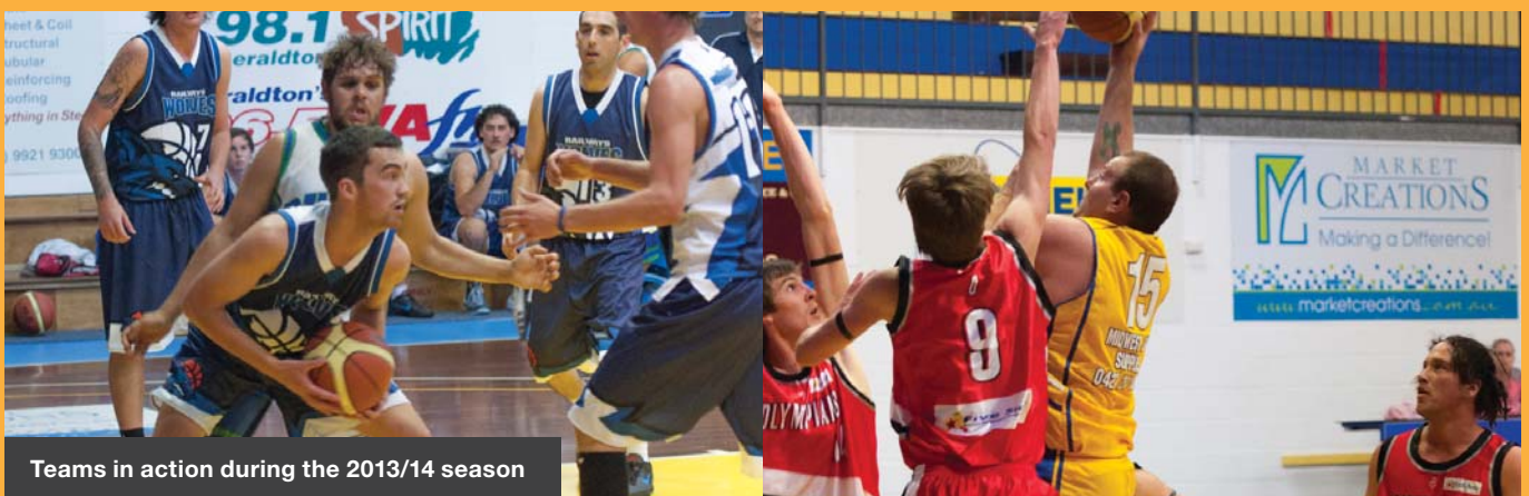
Teams in action during the 2013/14 season