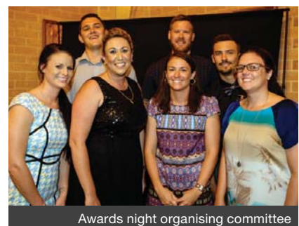
Awards night organising committee