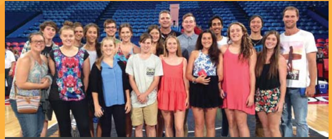
Young Guns at the Wildcats Game with Australian Basketball Legend Andrew Vlahov