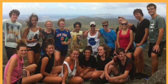
Young Guns squad at the top of Frenchman's Peak, Cape Le Grand National Park, Esperance.