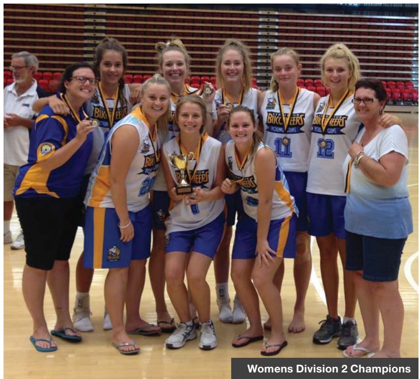
Womens Division 2 Champions