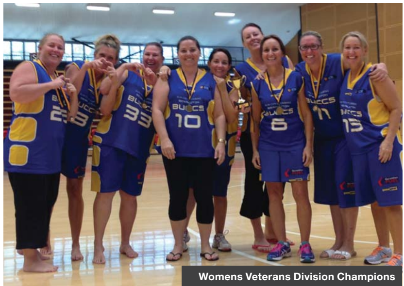
Womens Veterans Division Champions