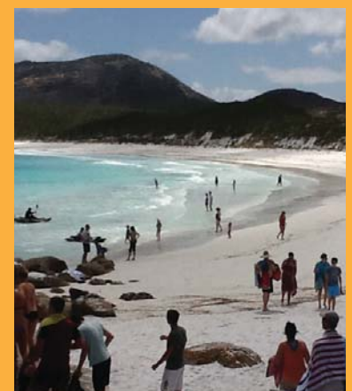
The team at Hellfire Bay, Cape Le Grand National Park, Esperance.