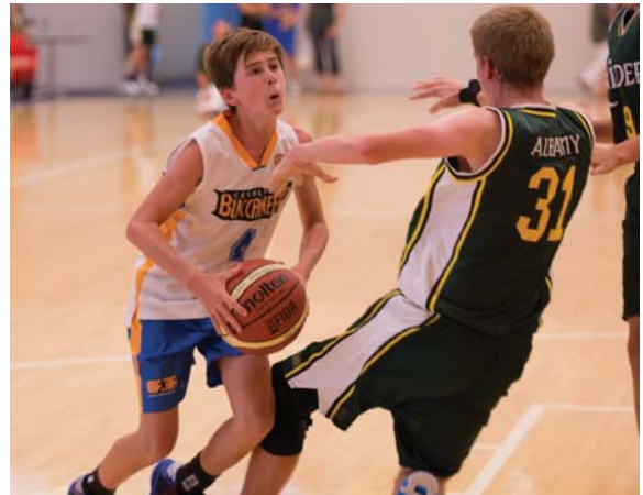
On court action at Country Week