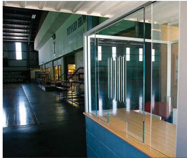
Welcome: The brand new entrance