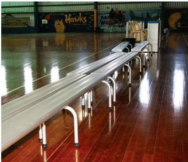
Take a break: New seating and score benches are now in between courts 2 & 3