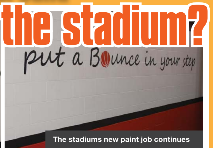
The stadiums new paint job continues

More changes are being made to the Activewest stadium every week. Recently we have welcomed new additions including: